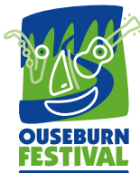
Illustration © Paul Shriek