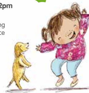
Illustration © Holly Sterling

Admission required if arriving before 1.45pm.