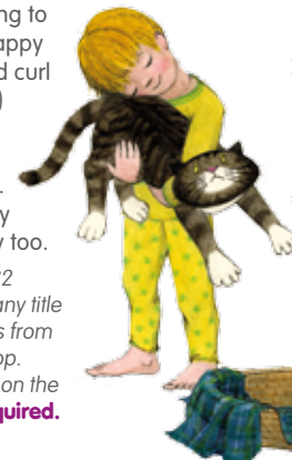
Illustration © Judith Kerr

Book must be purchased on the same day. Admission required.