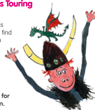
Illustration © Cressida Cowell