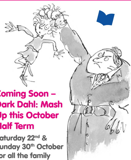
Illustration © Sir Quentin Blake

Come dressed as a mash up of your favourite characters and join us to find out.