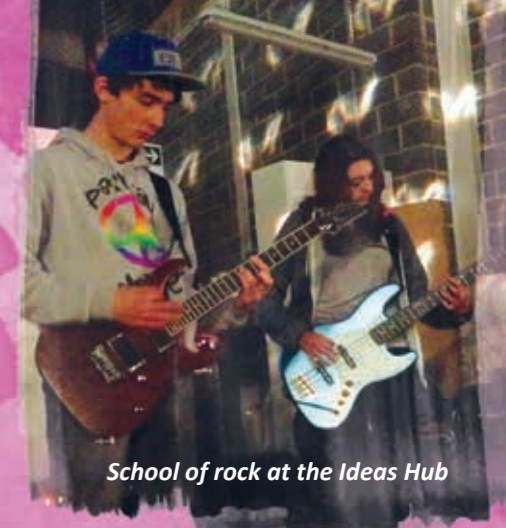
School of rock at the Ideas Hub

The Ideas Hub began life in September 2012 as a temporary pop-up café and event space for the 2012 Ideas Festival and continued due to popular support and the hard work of a growing band of volunteers. Provided for free by High Chelmer Shopping Centre, the space has confused passers-by with its giant To-Let sign over the door.