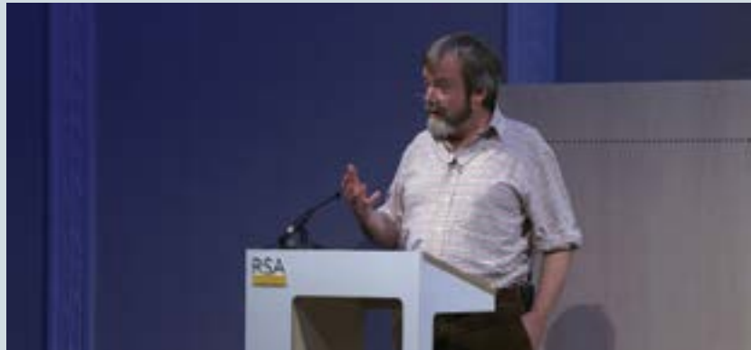
Dr. Iain McGilchrist at the RSA Event: What Happened to the Soul?

McGilchrist concluded his spiritual exploration in poetic fashion with an insightful quote from Eugene Gendlin: “We think more than we can say, we feel more than we can think, we live more than we can feel, and there is much else besides.” And perhaps, McGilchrist suggests, the “much else besides” is what we mean by the soul.