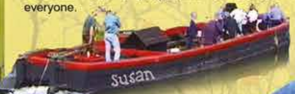
The Susan is the last remaining flat-bottomed barge purpose built for the Chelmer & Blackwater Navigation

Chelmsford city is blessed with its location astride the River Can and River Chelmer. Today we celebrate with a programme of activities for everyone.